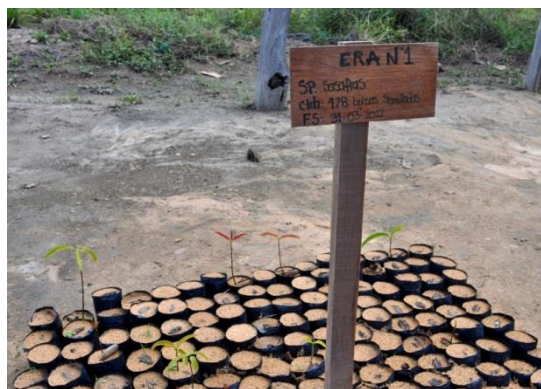
Germination trial with Sassafras at La Pedregoza

Growth: There are male and female Sassafras trees. Only females have seeds. The seeds are large with high moisture content (36 mm x 18 mm). They have to be germinated immediately after collection or they spoil. Collecting Sassafras seeds is a challenge, as female trees are often hard to find, and because the seeds ripen after the inundations begin, making access difficult. There are approximately 85 seeds in a kilogram. Seed collectors have to compete with birds, who like the seeds as food. The germination rate is often below 50%. La Pedregoza has test-planted Sassafras inside existing cultivations, as the tree needs shade. It is too early to know whether the Sassafras will adapt to those conditions or not. It would appear that Sasafrás is of moderate growth, but experiments with fertilizers and biochar might accelerate the growth rate. With shade, these trees could definitely be planted in low lying areas and in savannahs that flood.