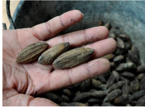
Semillas de Sasafrás

Pressures: Ocotea cymbarum is in the IUCN Red List of Threatened Species at a lower concern level, however this has not been revised in some time. There is ongoing illegal logging of Sassafras, because of its high value, and in many parts of Vichada it has become rare. With the exception of some test cultivations at La Pedregoza , there are no known Sassafras plantations in Colombia, and the tree suffers from logging without replanting.