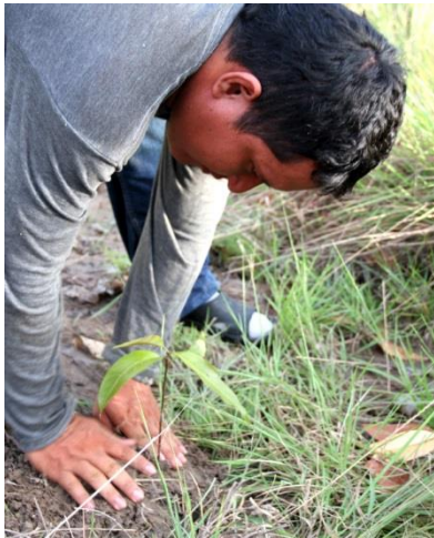
Siembra de Sasafrás en La Pedregoza

Recommendations: This species is an important niche tree in the biodiversity of Orinoco River basin forests. It is urgent that a seed bank for Ocotea cymbarum be established, and that alternative cultivations can take the pressure off the species in the wild. Due to its many uses, commercialization of Sassafras makes good economic and ecological sense, and can act as a conservation tool, while the species starts to recover. At La Pedregoza , we propose to conduct ongoing studies dedicated to learning how best to cultivate and conserve this tree.