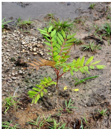
Simarrú seedling at La Pedregoza

Growth: Simarrú is considered to be of rapid growth, making it an interesting alternative to the use of introduced Acacia mangium as an afforestation species in Vichada. Seed distribution is by animals and birds. In fact, studies have shown that Simarrú seeds first ingested by monkeys have a better germination rate than seeds collected directly from the tree. The tree grows with a relatively straight trunk, another reason why it is popular as a carpentry wood. The crucial factor in cultivating Simarrú trees seems to be access to light. Planting experiments with the tree in rainforest versus open savannah have shown that Simarrú may grow up to seven times faster if light access is not limited. This species may also benefit from traditional ditching methods to reduce below ground competition when planted, as it develops good root systems that in turn prevent erosion.